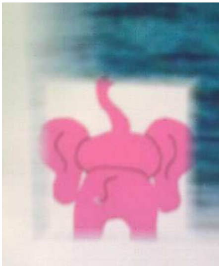
Elephant on poster