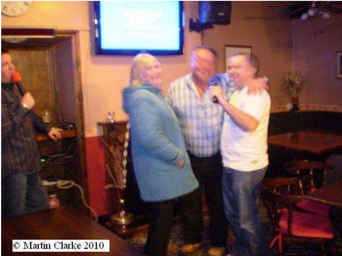
Singing loud and badly with a local lady in the Plough Inn. ( ‘Green Green grass of home’ I think)