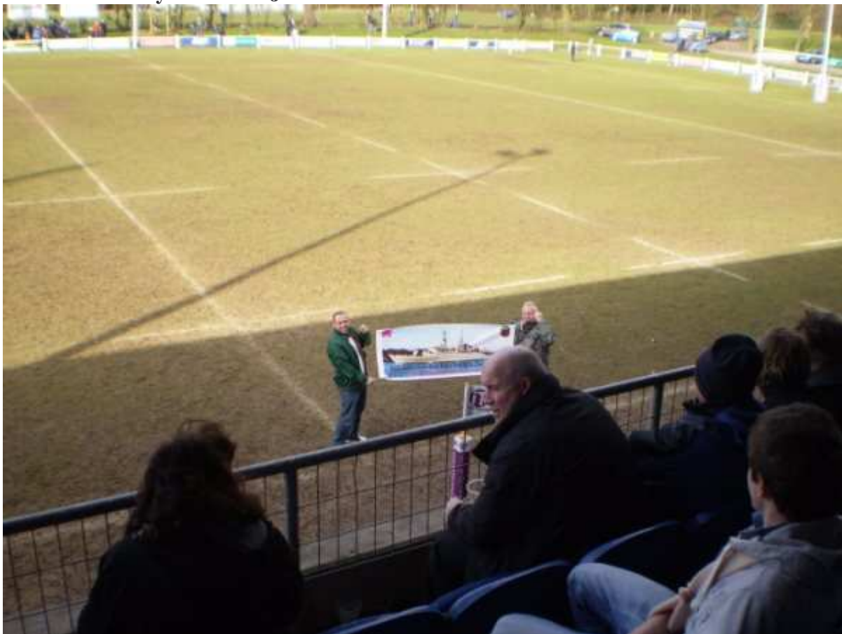
More hooligans at Macclesfield RFC! The rest of use were collecting for Charity.