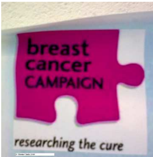
Cancer research Logo