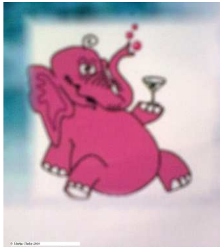
Drunken Elephant on poster