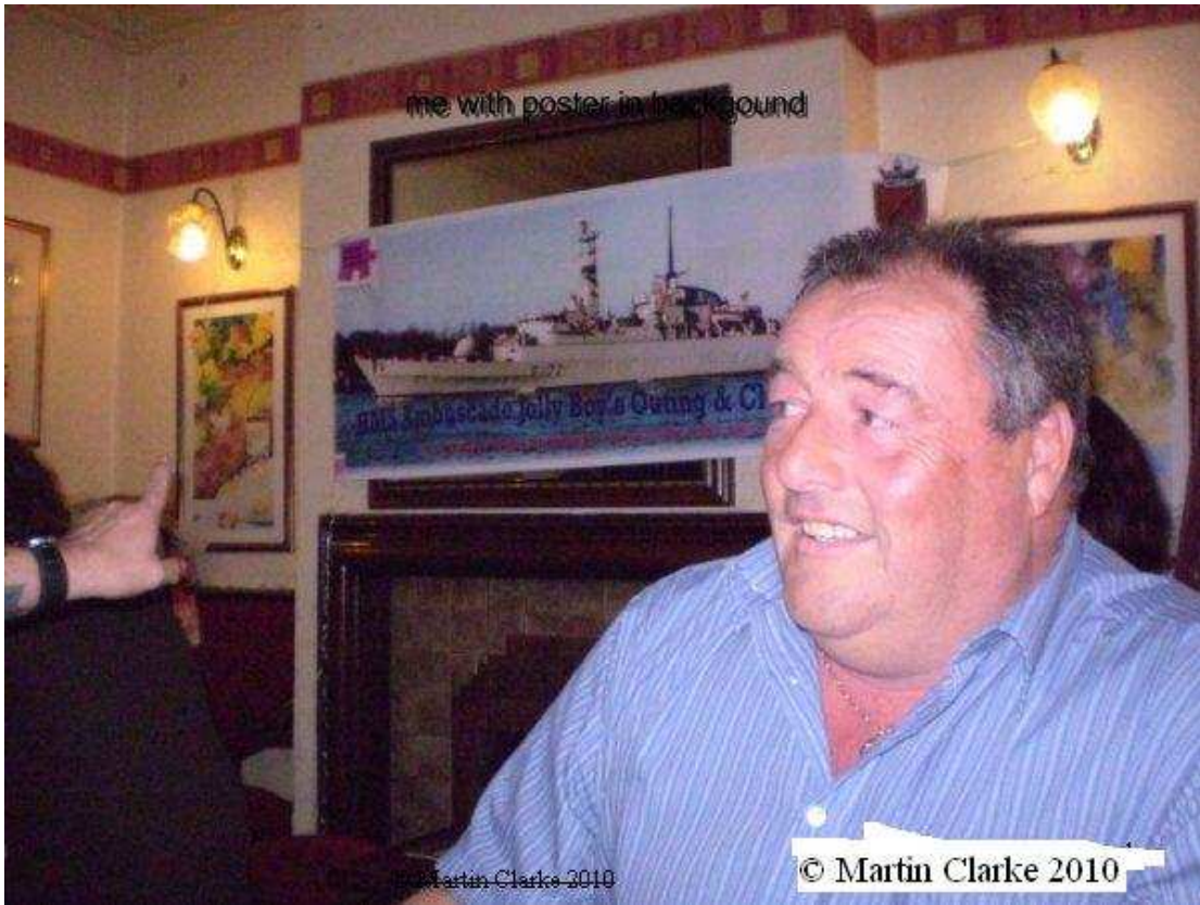
Me in the first pub, with Amber's poster in Background.

The pub-crawl then ensued. We were made most welcome in all the pubs we visited. Some of us had not seen each other since 1979